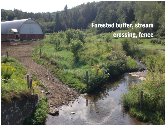
Forested buffer, stream crossing, fence