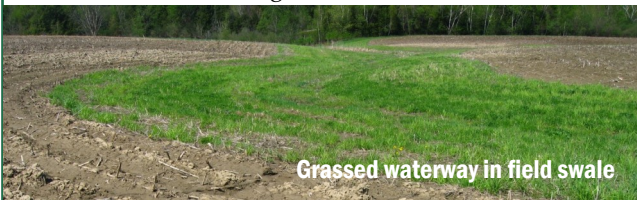
Grassed waterway in field swale

Grassed Waterway: A shallow vegetated swale designed to convey concentrated runoff to surface waters without causing erosion.