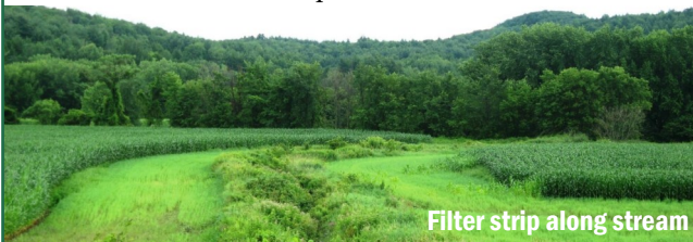
Filter strip along stream

Filter Strip: A grassed area that helps reduce sediment, nutrient, and pollutants in runoff.