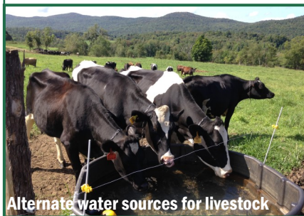
Alternate water sources for livestock

The payments from CREP come in two forms: an upfront incentive payment from both the State and FSA and annual payments from FSA for the next 15 years. The payments are based on the quality of soils within the buffer area and the type of agricultural use the land has had within the last decade. Contracts run for 15 years, during which time the buffers must be maintained by the contracted individual.