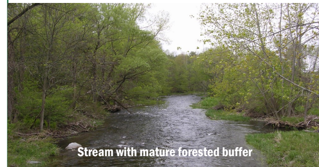
Stream with mature forested buffer